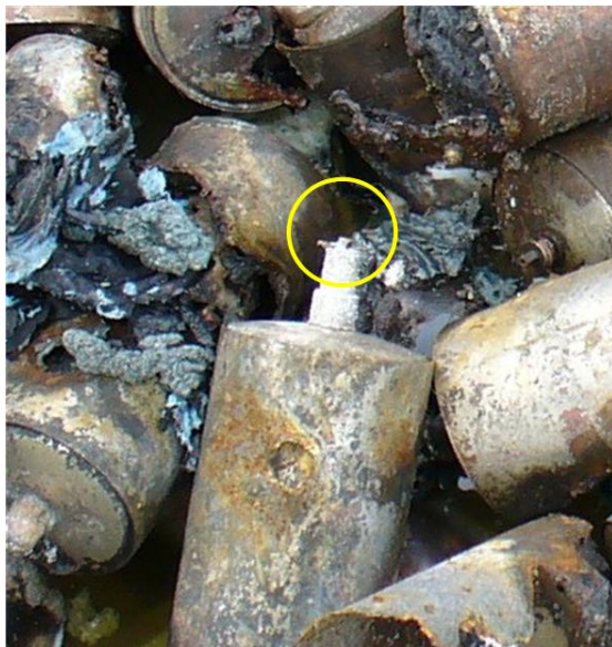
Figure 2. Oxygen generator with activation pin circled

fire, produce oxygen that significantly increases the intensity of a fire, the CSB concluded that the unspent oxygen generators most likely contributed to the rapid spread of the fire to the adjacent bay where flammable hazardous wastes were stored.