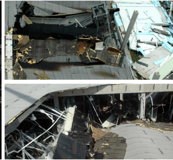
Interior of ConAgra facility following structural collapse.