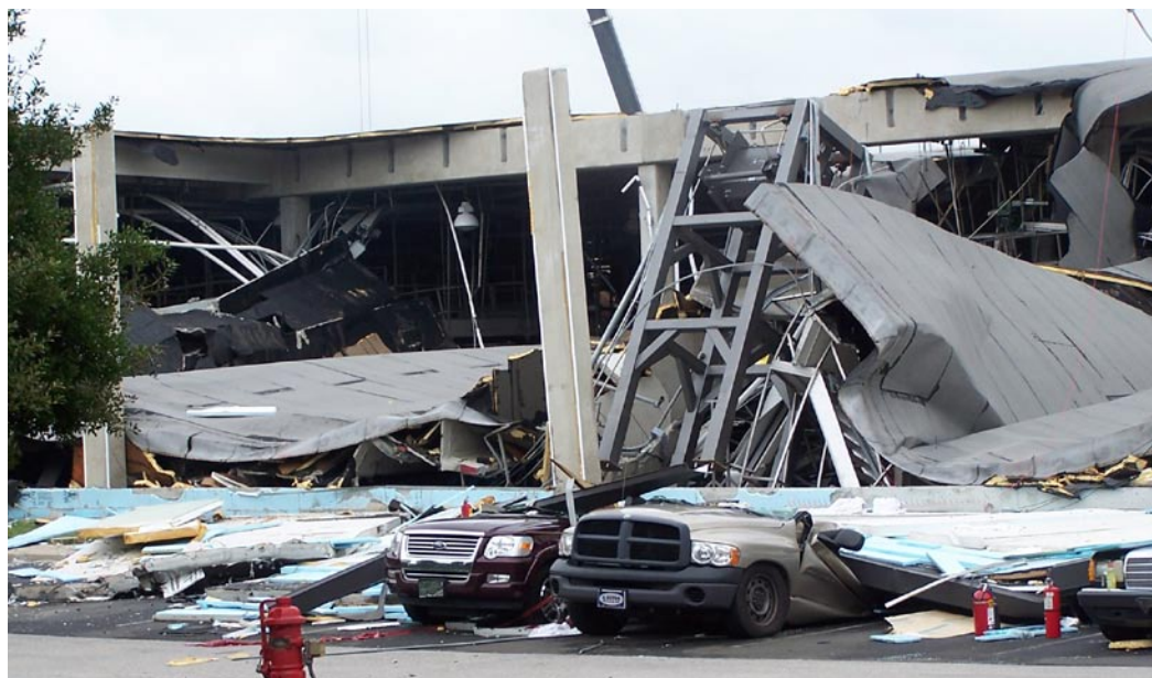
The ConAgra Slim Jim plant in Garner, North Carolina, where unsafe gas purging caused an explosion in June 2009 that killed three workers and sent 71 to the hospital.

one of two methods: (a) fuel gas is used to directly displace the air, or (b) inert gas is used to displace the air and then fuel gas is used to displace the inert gas. With this Safety Bulletin, the U.S. Chemical Safety Board (CSB) draws attention to serious dangers that can arise during fuel gas purging operations and highlights five key lessons the agency recommends for improving safety in the workplace.