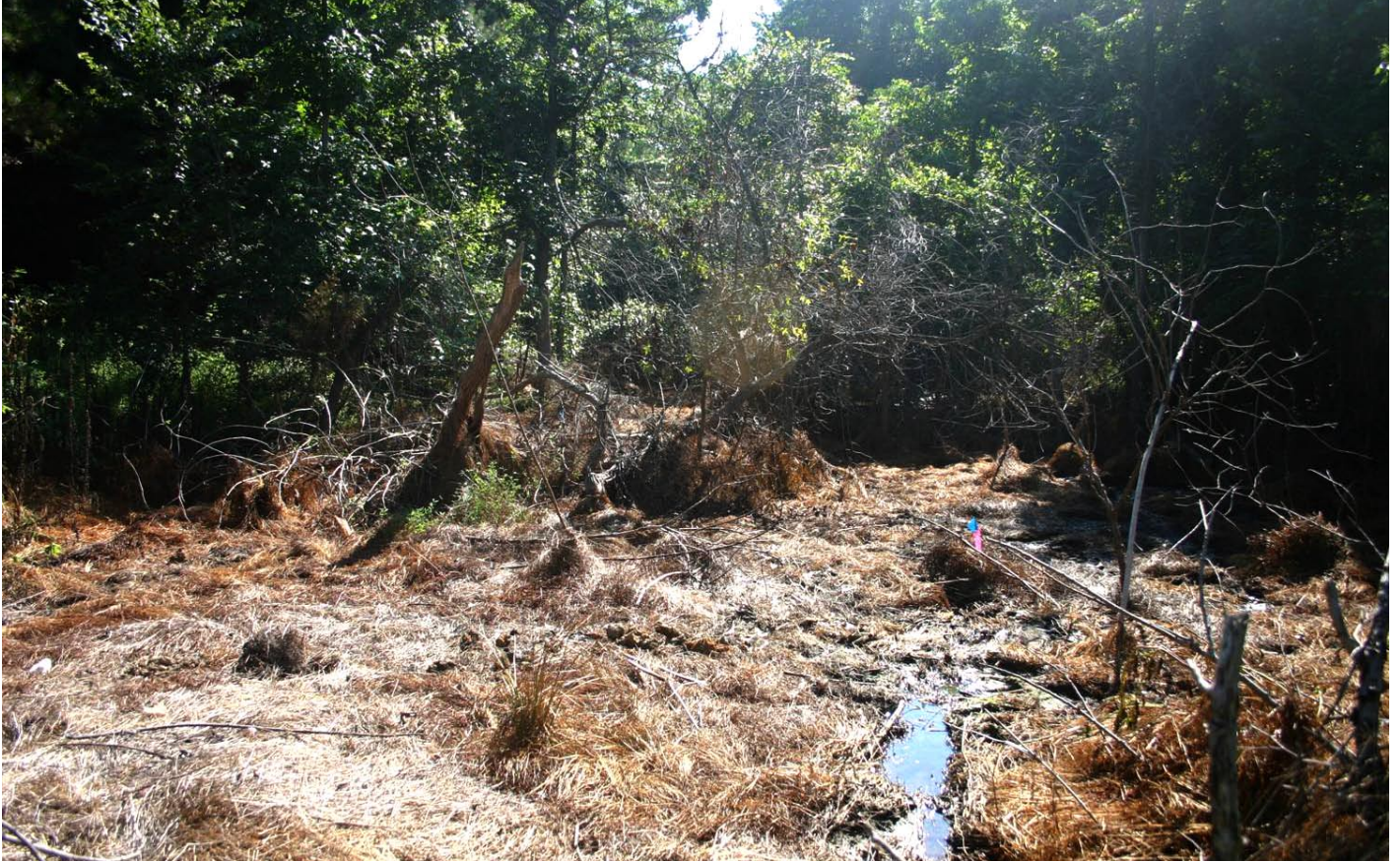
Damage to vegetation hundreds of feet away from the ConAgra plant due to the ammonia release that followed the explosion.

ESA and ConAgra employees were aware of the natural gas purging activities inside the utility room. However, no appropriate combustible gas detectors were used to warn of a potential accumulation of gas in the building. Instead personnel relied primarily on the sense of smell to determine when the piping had been effectively purged of air and whether or not an unsafe release of natural gas occurred.