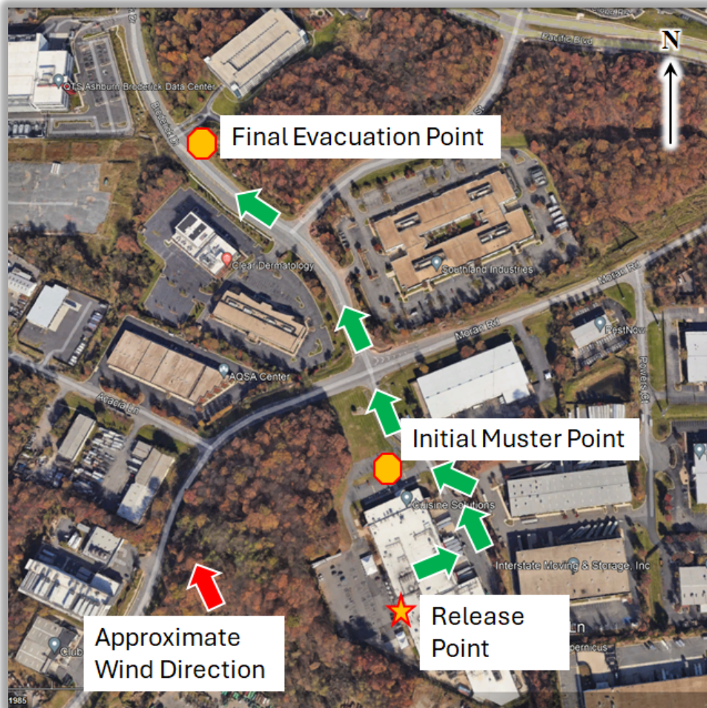
Figure 4. The Evacuation route (green arrows) that most workers followed via the east side of the building to avoid the release on the west side (yellow star). (Credit: Google Earth, annotated by CSB)