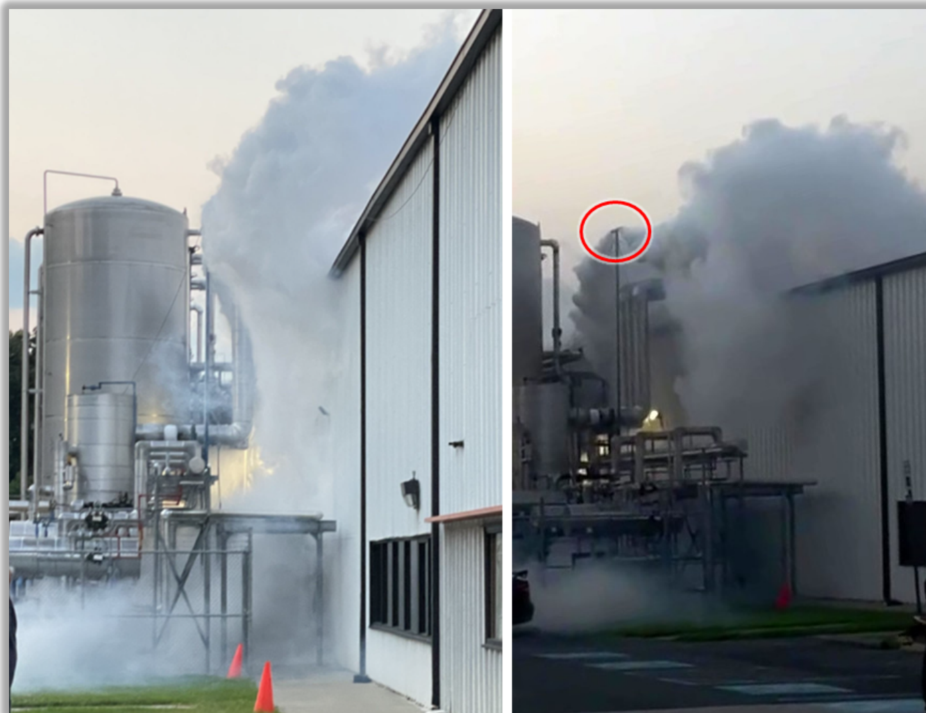
Figure 2. Images of the visible ammonia cloud during the release and of the release point (circled, right) through a horizontal tee. (Credit: Cuisine Solutions employees, annotation by CSB)