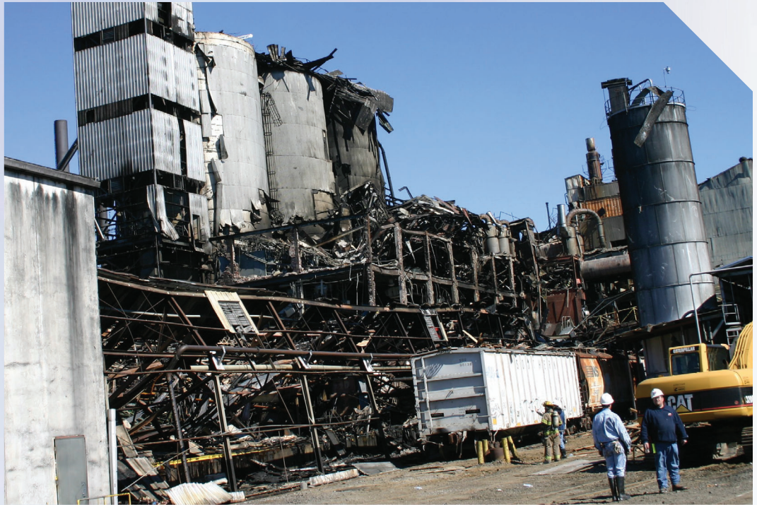
View of the massive damage caused by the combustible dust explosions and fires at Imperial Sugar.

2203.1, entitled “Owner Responsibility” has been added which states: “The owner or operator of a facility with operations that manufacture, process, blend, convey, repackage, generate or handle potentially combustible dust or combustible particulate solids shall be responsible for compliance with the provisions of this code and NFPA 652.” Section 2203.2 entitled “Dust Hazard Analysis” has also been added which states: “The requirements of NFPA 652 apply to all new and existing facilities and operations with combustible dust hazards. Existing facilities shall have a dust hazard analysis (DHA) completed in accordance with Section 7.1.2 of NFPA 652. The fire code official shall be authorized to order a dust hazard analysis to occur sooner if a combustible dust hazard has been identified in a facility that has not previously performed an analysis.”