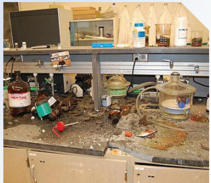
View of the damaged caused by the 2010 incident at Texas Tech

On January 7, 2010, a graduate student within the Chemistry and Biochemistry Department at Texas Tech University (Texas