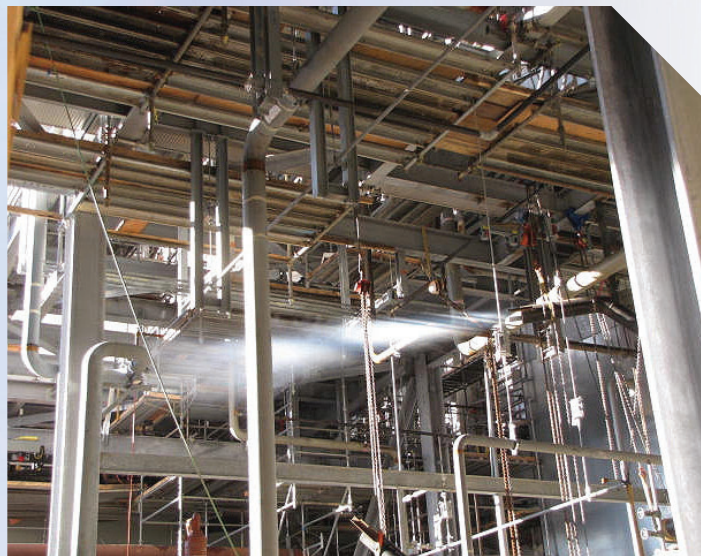
Photo of "gas blow" method which was used at Kleen Energy to remove debris from the piping.

The 2 nd Edition of API RP 755 is slated for release in early 2019.