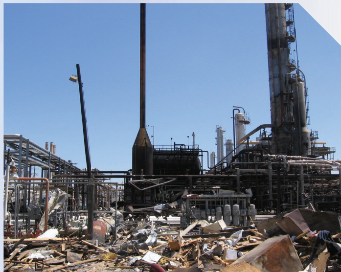
View of the BP Texas City refinery following the March 23, 2005 explosions and fire.

On March 23, 2005, the BP Texas City refinery experienced explosions and fire in an isomerization unit (ISOM) that resulted in 15 deaths, 180 injuries, and significant monetary losses. The accident was caused by the overfilling of a raffinate splitter tower during startup, which in turn opened pressure relief devices and dumped flammable liquid into a blowdown drum with a stack that was open to the atmosphere. The flammable liquid exceeded the capacity of the blowdown drum and erupted out of its stack into the surrounding area where it ignited, resulting in the explosions and fire.