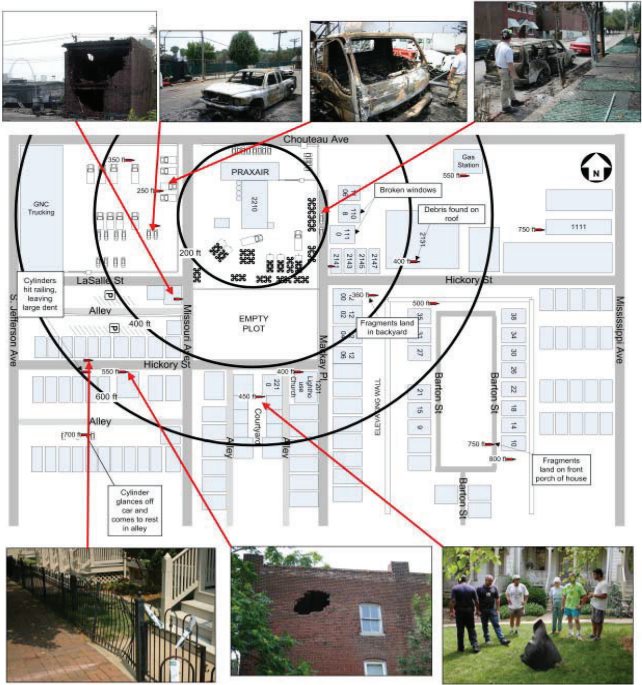
Figure 5. Community Impact