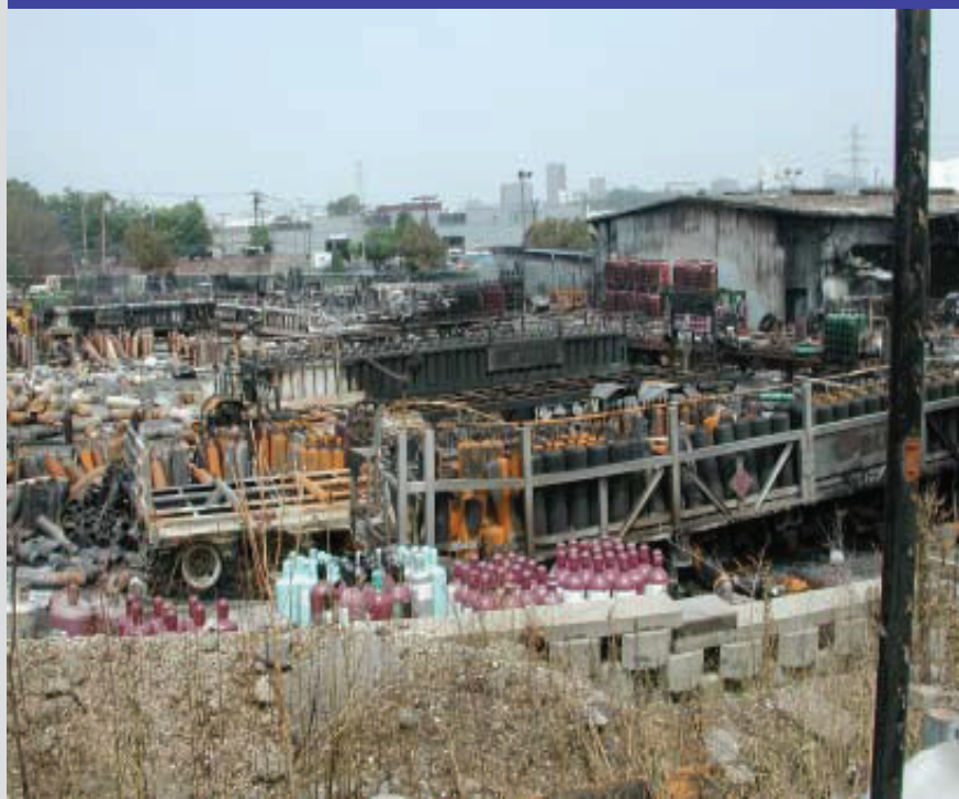
Figure 6. Facility Damage