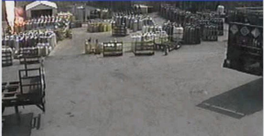
Figure 4. Spreading Fire (three minutes after ignition)