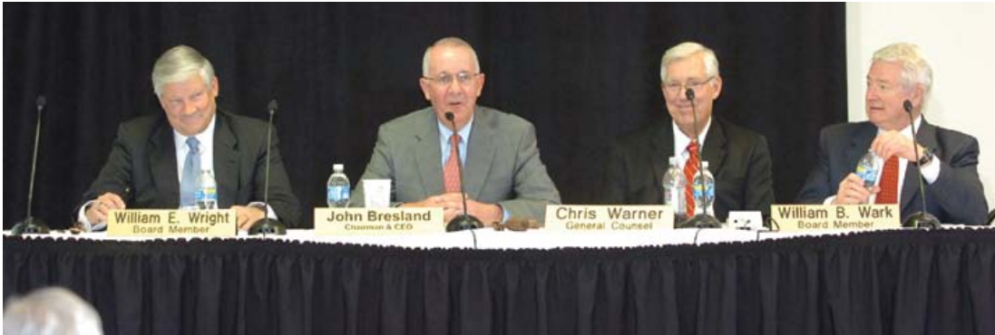
CSB Board Members and General Counsel at the 2009 Bayer CropScience public meeting in Institute, WV.

underlying causes such as inadequacies in safety management systems and safety culture, and opportunities for improving regulatory standards and enforcement. The CSB makes safety recommendations to regulatory agencies, companies, industry organizations, standard-setting bodies, first responders, and labor groups.