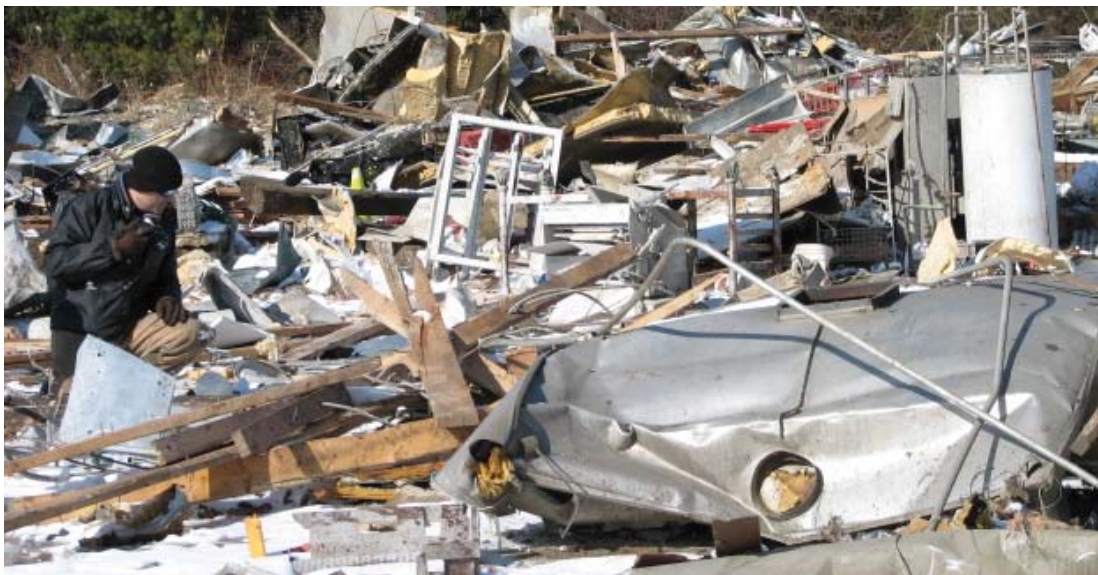
Four were killed when propane vapors ignited and exploded at the Little General store in Ghent, WV. The CSB issued its investigative report September 25, 2008.

The CSB has also issued recommendations to state and local governments, individual companies, and specific facilities. The CSB recommendations issued pursuant to an