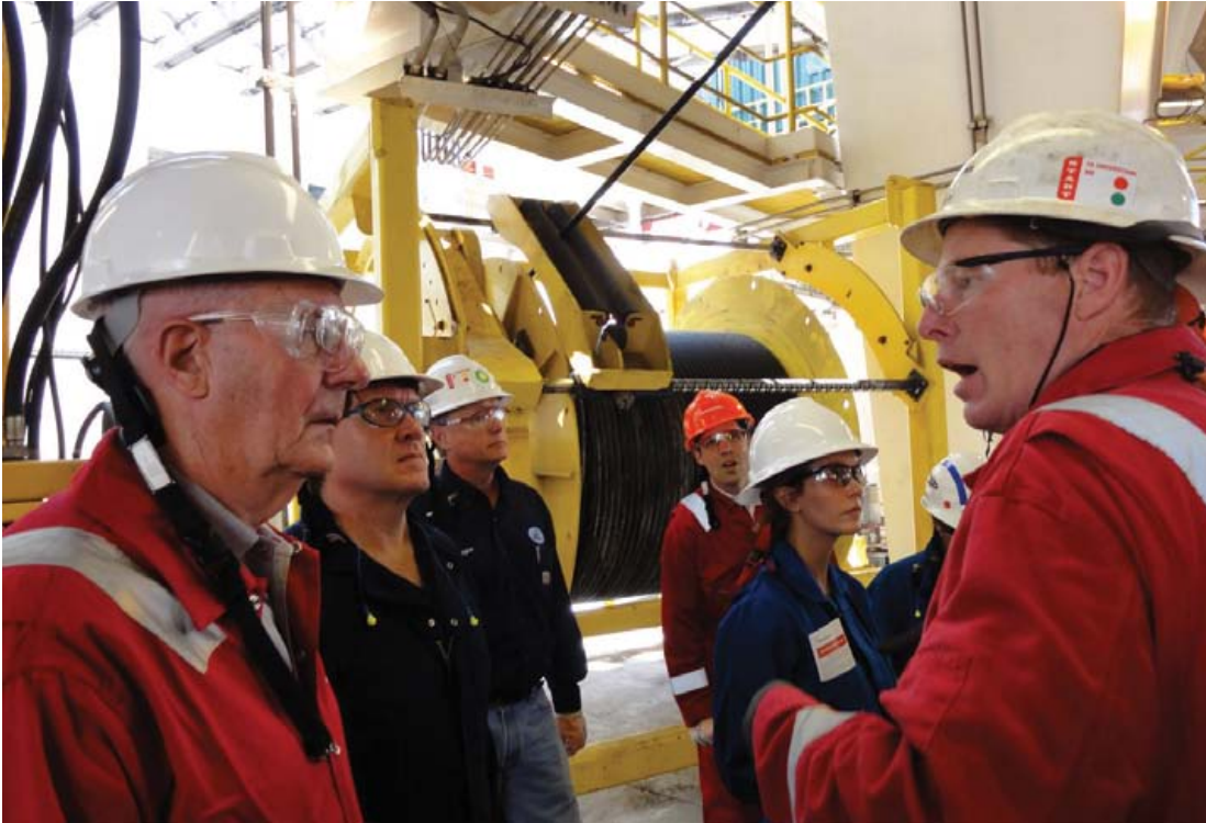
CSB Board Member and Investigators Tour Offshore Oil Rig

teams, providing input in the report development process, voting on final CSB products and recommendations and advocating for safety recommendations. The CSB's enabling language provides that board members be appointed based on technical qualifications, professional standing, and demonstrated knowledge of incident reconstruction, safety engineering, human factors, toxicology, and air pollution regulation.