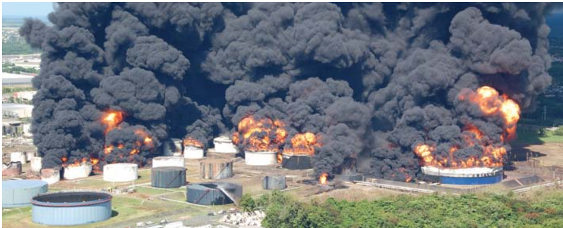
A massive fire and explosion sent huge flames and smoke plumes into the air at the Carribean Petroleum Corporation near San Juan, Puerto Rico