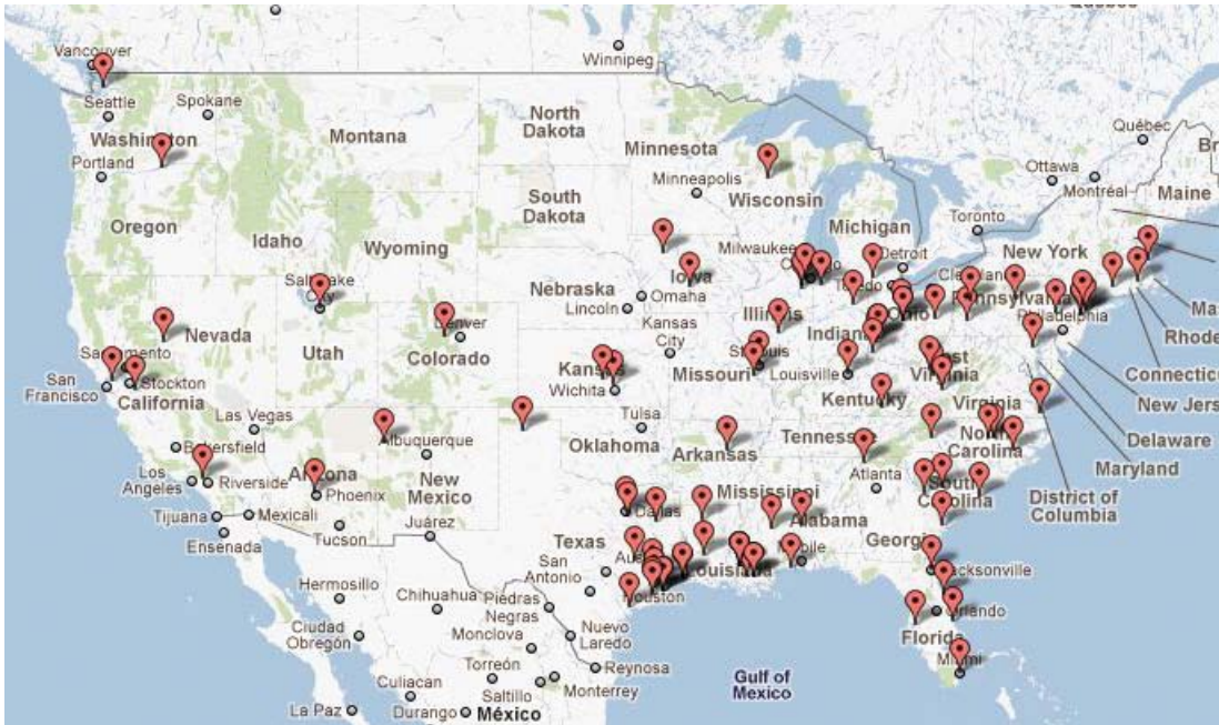
FIGURE 1 CSB completed investigations since 1998

spaces with hazardous atmospheres. In addition, international stakeholders have benefited from lessons learned from U.S. domestic incidents: our recommendations on industry best practices have been adopted in numerous countries over the past decade and have resulted in improved worldwide process safety knowledge. In fact, the CSB’s investigative reports and safety videos are used extensively around the world, especially in countries with a significant chemical and oil industry presence. The CSB receives