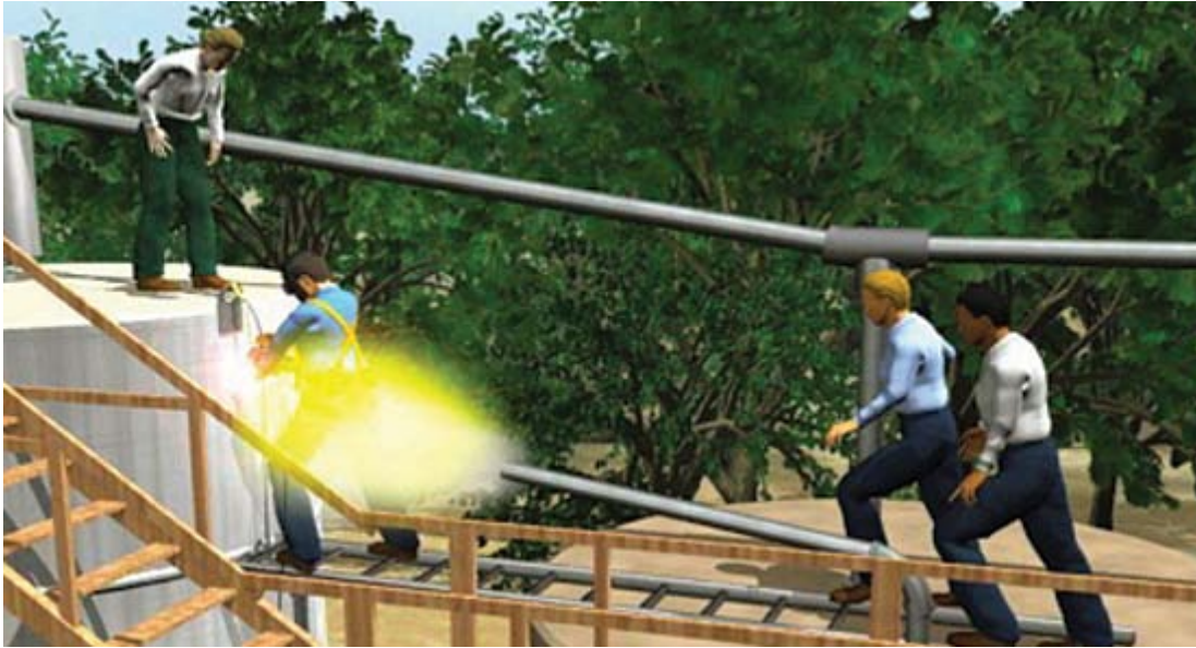
FIGURE 10 The safety video Dangers of Hot Work won a CINE Golden Eagle award in 2010. (Dramatization from CSB safety video, Dangers of Hot Work , June 7, 2010)

The CSB safety videos have become known as a best practice in disseminating government safety information and have been used to support training by a large number of international organizations. In the four years prior to FY 2012, over 75,000 video DVD compilations were distributed to individuals, trade associations, universities, companies,