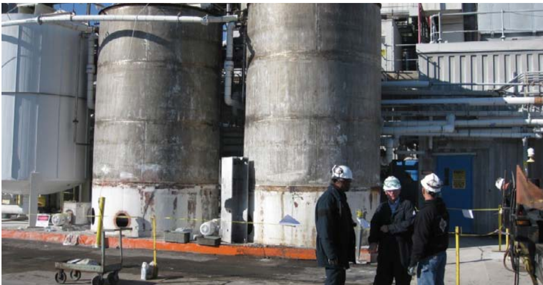
CSB investigators at a DuPont plant after a fatal hotwork explosion in November 2010

The Human Capital Plan also details a number of specific tactics to improve the