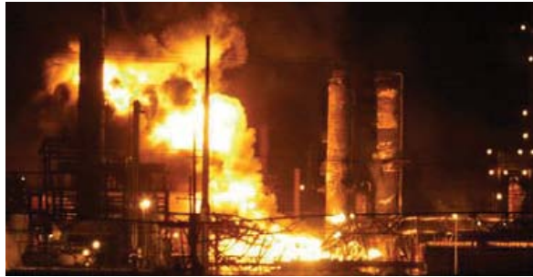
Liquefied petroleum gas fire at Valero's Mckee Refinery near Sunray, TX, February 16, 2007

GOAL 3: Preserve the public trust by maintaining and improving organizational excellence.