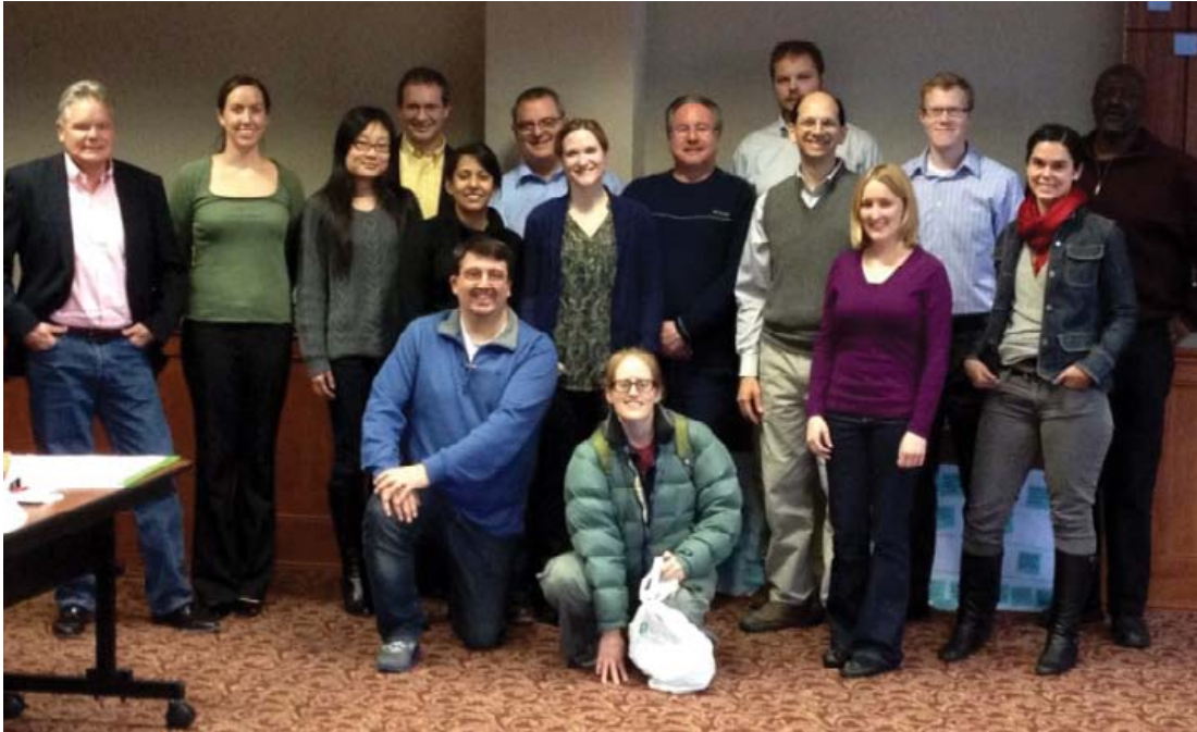
CSB investigation and recommendations staff at a training session

Denver offices. CSB is also working towards incorporating its administrative records into its electronic records management system. Finally, the agency has procured SharePoint, a collaborative platform with user friendly dashboard interfaces that enable web-based sharing of items such as calendars and documents, that will be implemented in the coming years.