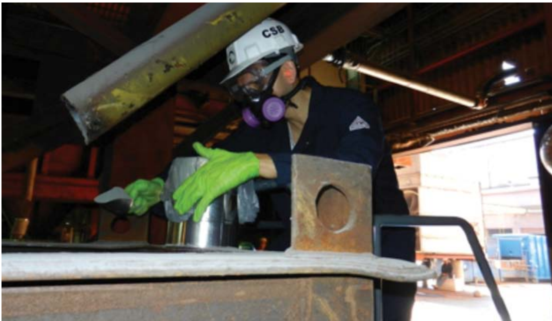
CSB investigator collects dust samples from a Hoeganaes facility in Gallatin, TN, which experienced multiple iron dust flash fires during a six month period in 2011.