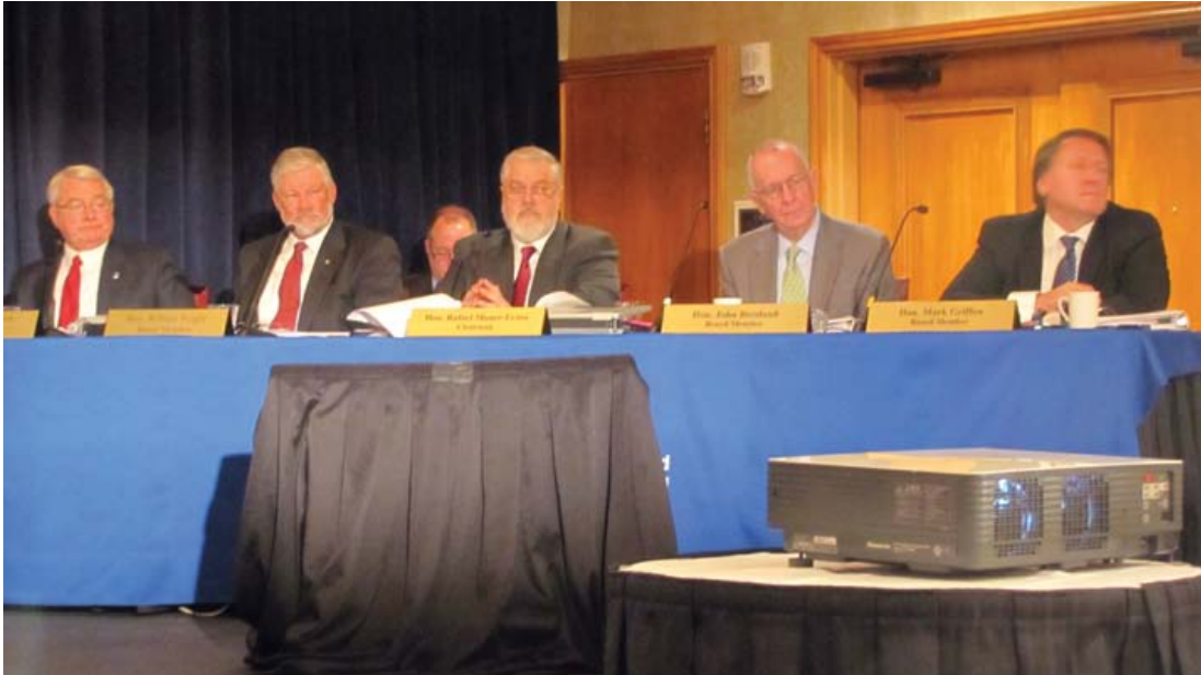
CSB Board Members preside over the 2010 hearing in Washington DC to hear expert testimony on regulation of offshore oil and gas safety practices

OMB CIRCULAR A-136 —designates financial reporting requirements for federal agencies from the Executive Office of the President (i.e., the Performance Accountability Report (PAR)).