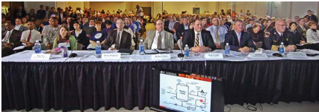
CSB's 2009 Bayer Public Meeting

Finally, the CSB strategic planning process includes the development and implementation of specific performance measures and associated target levels for achievement that are the performance goals for the agency. This plan details those performance measures that will be sustained throughout the entire strategic plan four-year period. In addition, the agency develops an annual action plan (annual performance plan) that includes many additional performance measures that correspond to a specific fiscal year. The 2012–2016 CSB Strategic Plan , the annual CSB Action Plan, and individual performance plans constitute the foundation of the organization's performance management framework.