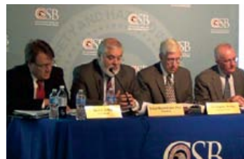
Current members and general counsel of the U.S. Chemical Safety and Hazard Investigation Board (CSB)

workers, the public, and the environment. Since fiscal year 1998, the year CSB