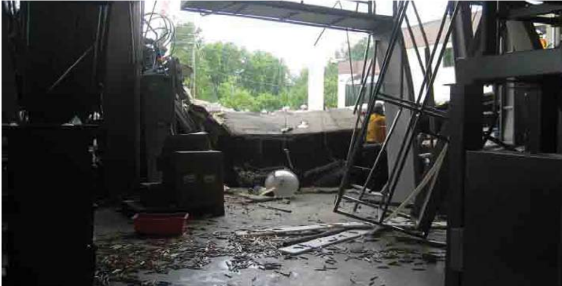
12 Investigative staff deployed to the ConAgra plant after an explosion on June 9, 2009 that killed 4 workers and injured dozens of others.

consequences and preliminary understanding of the potential causes and analyzed according to several factors such as the severity of injuries, property losses, and offsite impacts. The factors are scored numerically and