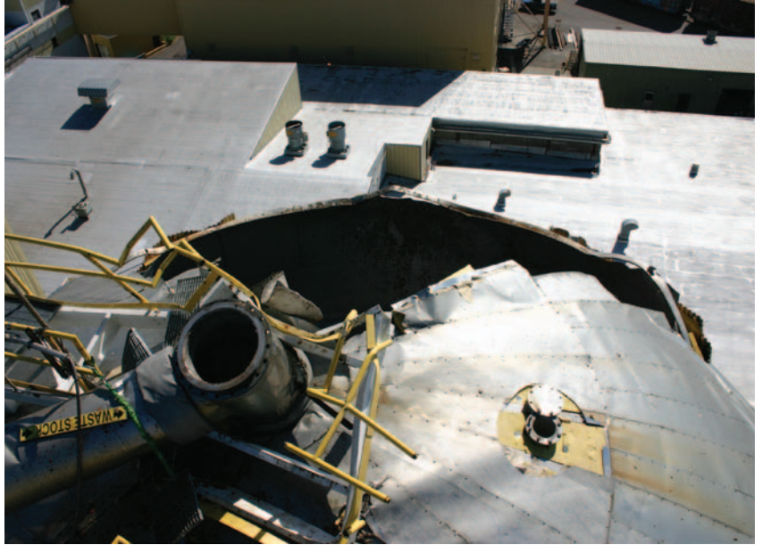
Views of the storage tank involved in the 2008 explosion at Packaging Corporation of America.