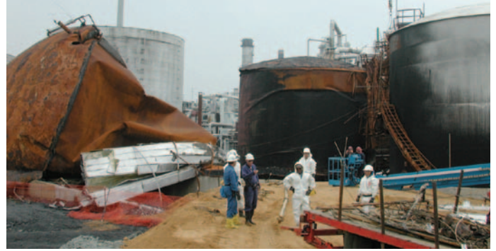
A view of the flammable storage tank involved in the accident at the Motiva Refinery.

Motiva had a hot work program that included written permits, but the program was inadequate. Hot work was allowed near tanks that contained flammables including